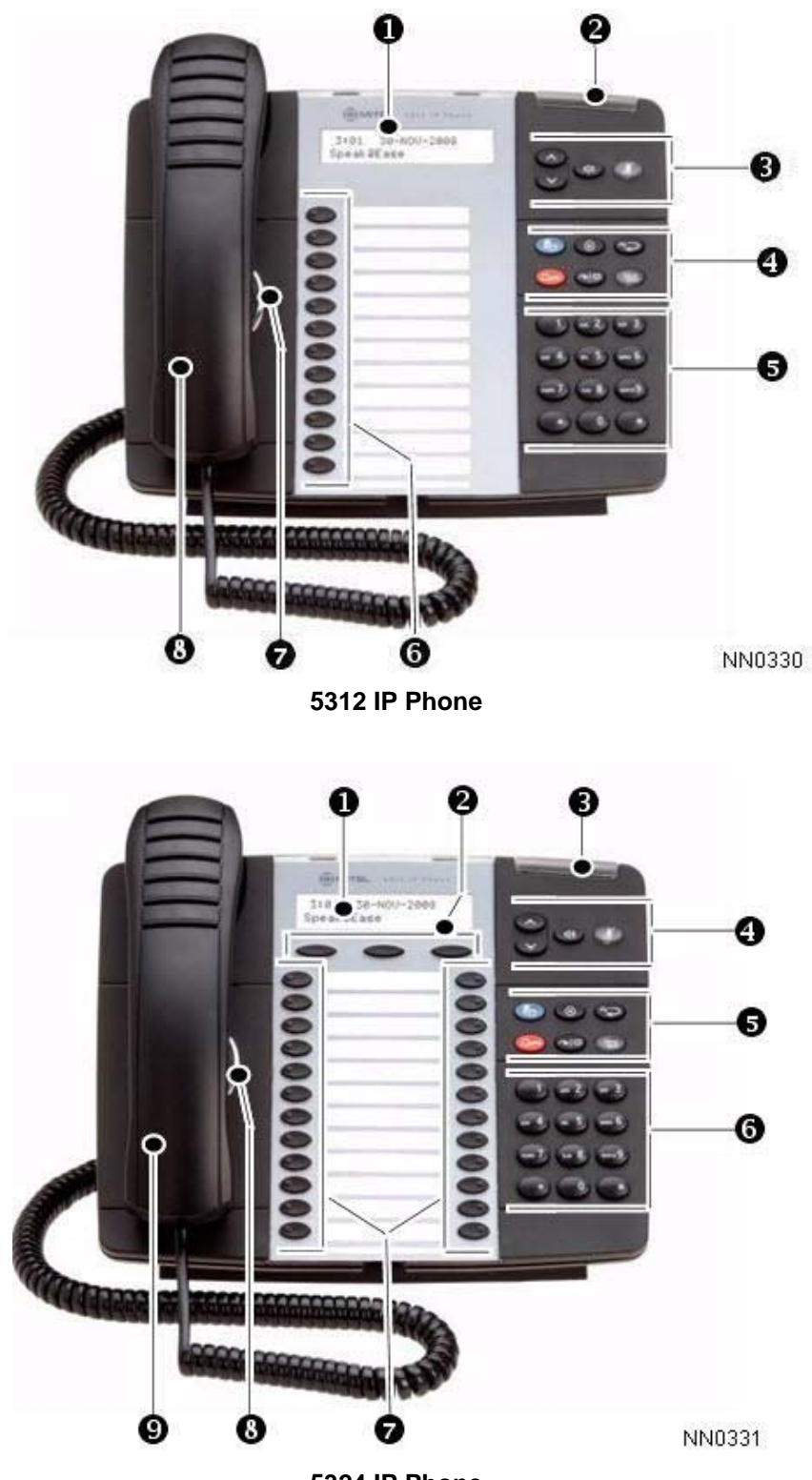
5324 IP Phone